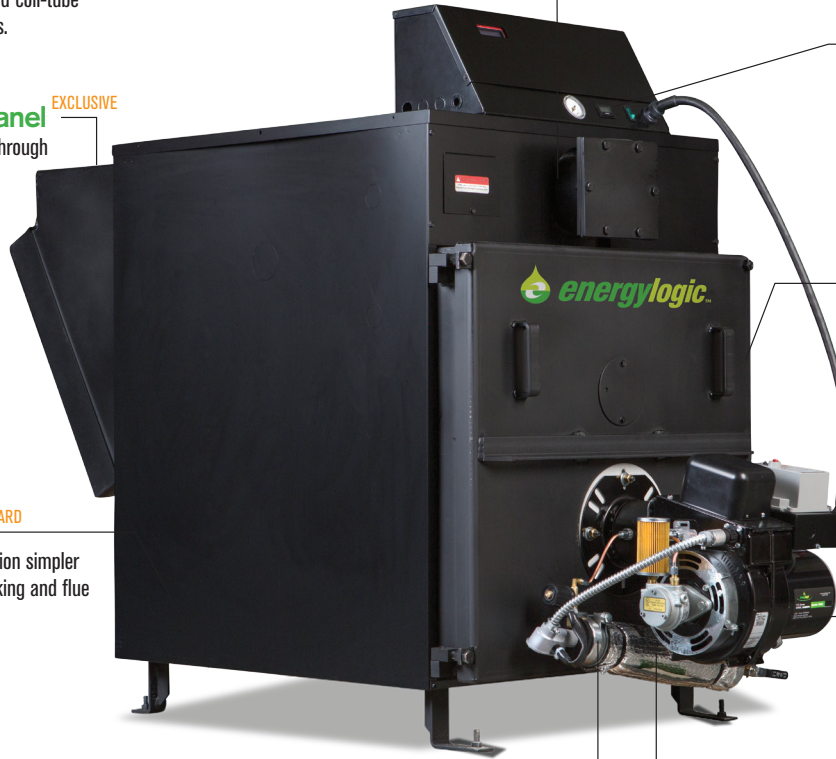
Pictured: 375B boiler

Rapidly heats the widest range of viscosities of used oil, synthetic oil and other acceptable fuels.