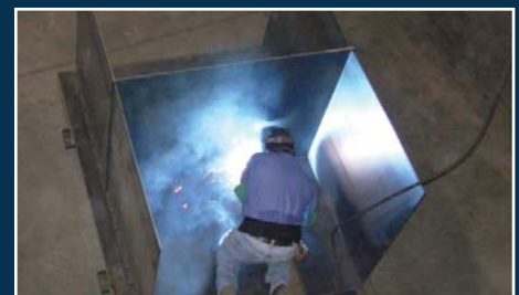
The Bench Top can be designed with custom compartments for multi-purpose use.