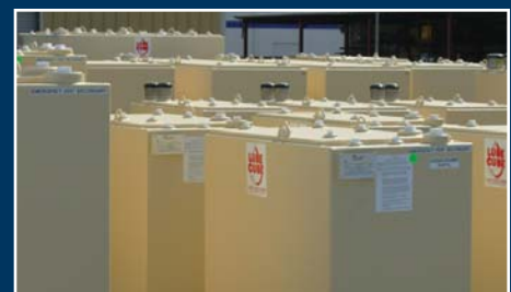
Lube Cube tanks are available in standard sizes from 60 to 20,000 gallons.