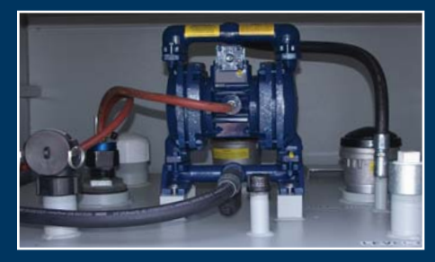
The SafeWaste mechanical components are enclosed in an easily accessible compartment.