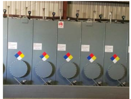
20,000 gallon, 8 compartment tank.

* Savings will vary by area, and are dependant on insurance carrier.