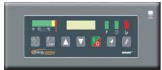
Optional Level II (CRE190-CRE675)