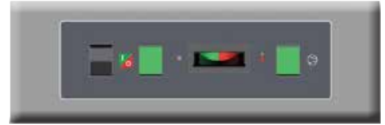
Standard Level I (CRE90-CRE140)