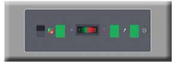
Standard Level I (CRE190-CRE675)