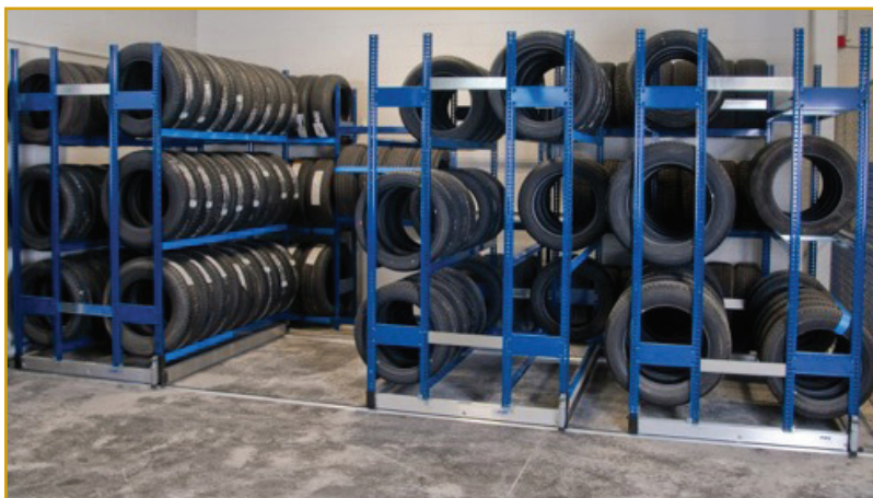
Manual Mobile System