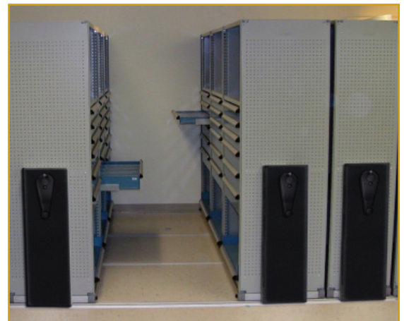
Mechanical-Assist Mobile System