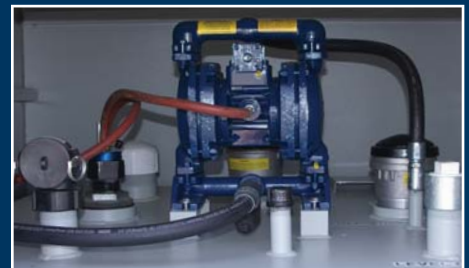
The SafeWaste mechanical components are enclosed in an easily accessible compartment.