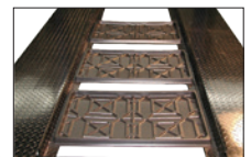
Three (3) Drip Trays