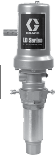
LD Series 3:1 Pump