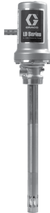
LD Series 50:1 Pump