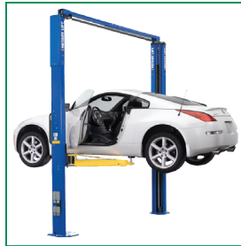
Asymmetric design allows for open door clearance.

Rotary's AT07 2-Post lift offers maximum drive-through clearance with minimum external dimensions. The asymmetrical design of the posts and supporting arms also provides a spacious pick-up area, allowing the lift to be entered from either side.