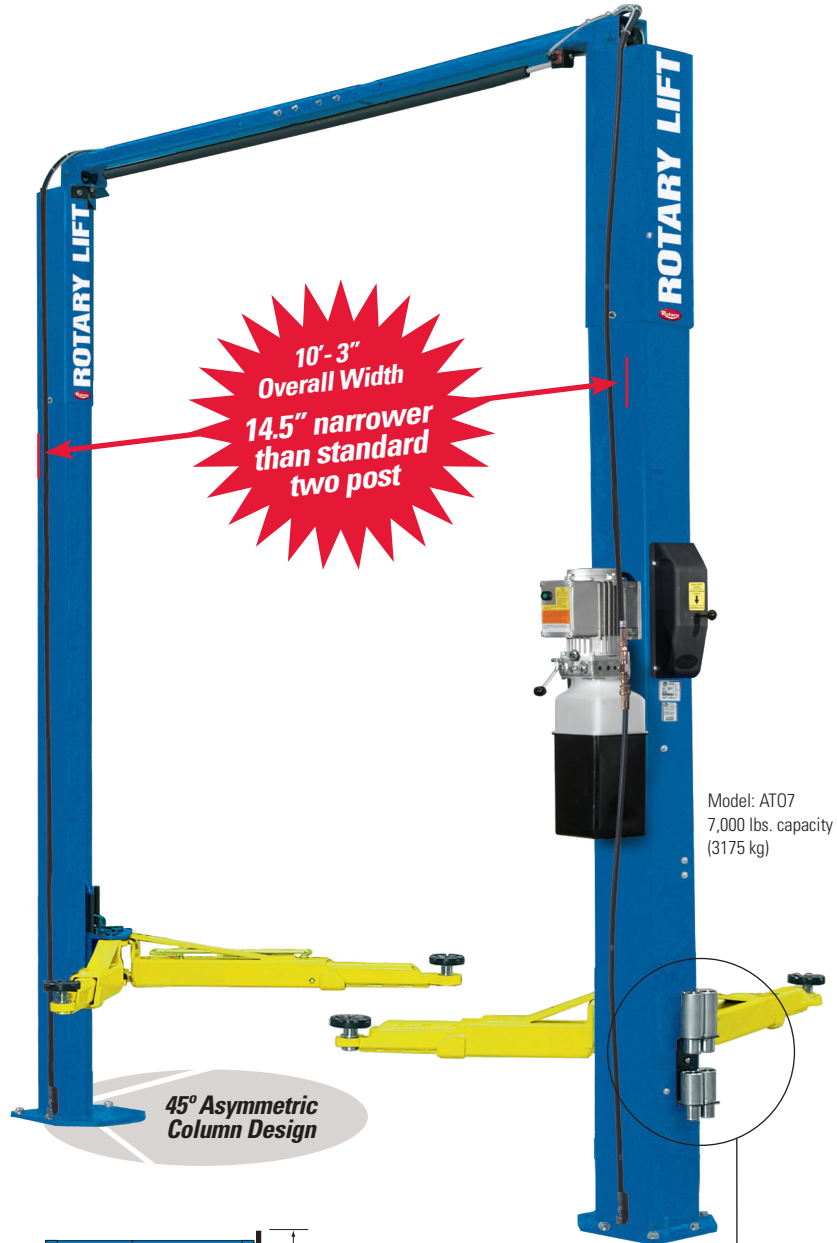
Model: AT07 7,000 lbs. capacity (3175 kg)