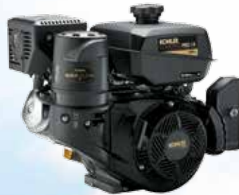
KOHLER 14 HP - Command Pro CH440

H - Honda. K - Kohler. NOTE: Only pressure lubricated units are capable of 250 PSIG operation. Units tested in accordance with CAGI/PNEUROP Acceptance Test Code PN2CPTC3. Dimensions are for R-Series compressors. Add 1" to the width for PL units.