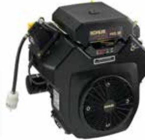
KOHLER 20 HP - Command Pro CH640