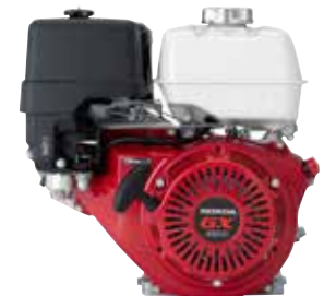
HONDA 13 HP - GX390