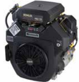
KOHLER 23 HP - Command Pro CH680