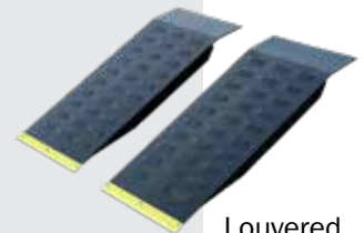
Lowered approach ramps

Challenger's 14,000 lb. closed-front drive-on 4-post lift features a low approach angle and wide runways for easy approach. It also has one of the highest rise in the industry and durable column construction. We designed the 4P14 for versatility, with lowered approach ramps as well as in two lengths. A range of optional accessories can help you accommodate just about anything that comes in for service.