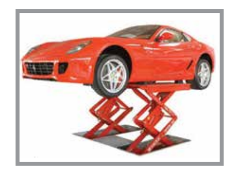
Flush or Surface Mounted