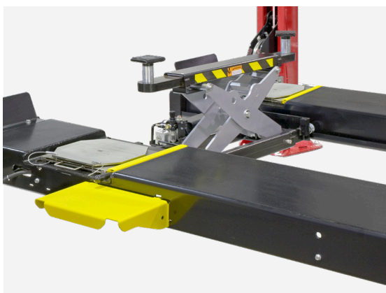
4-Post Flat Deck General Service and Alignment Rack Package 15,000 Lb. capacity

and service a wide range of vehicles. Anything from a small passenger car to a medium-duty truck, and even medium-sized vans. All while boosting workplace safety with our open front design, assisting technicians moving around a vehicle's frame.