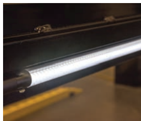
Automatic LED lighting