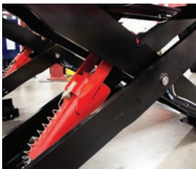
Dual hydraulic cylinders